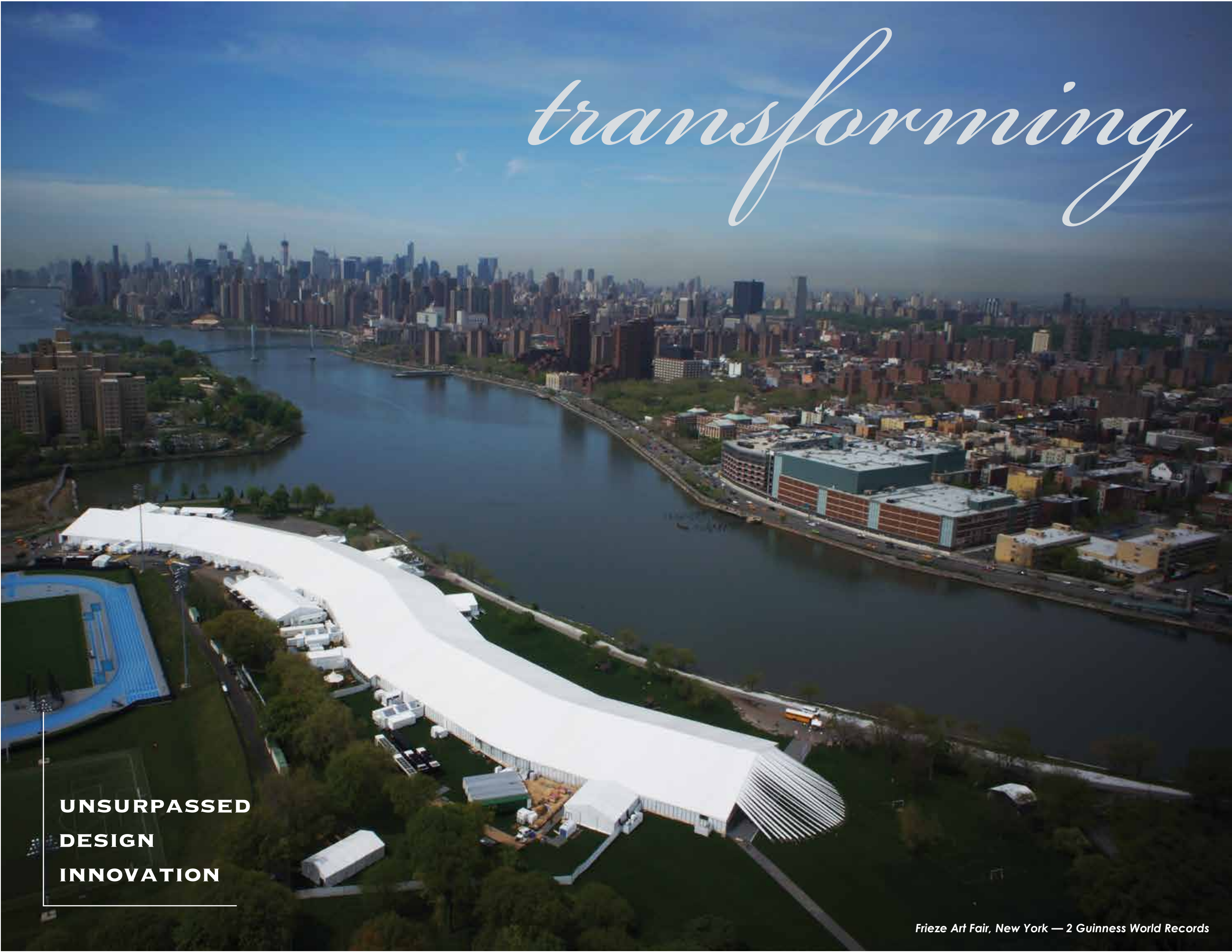
Frieze Art Fair, New York — 2 Guinness World Records