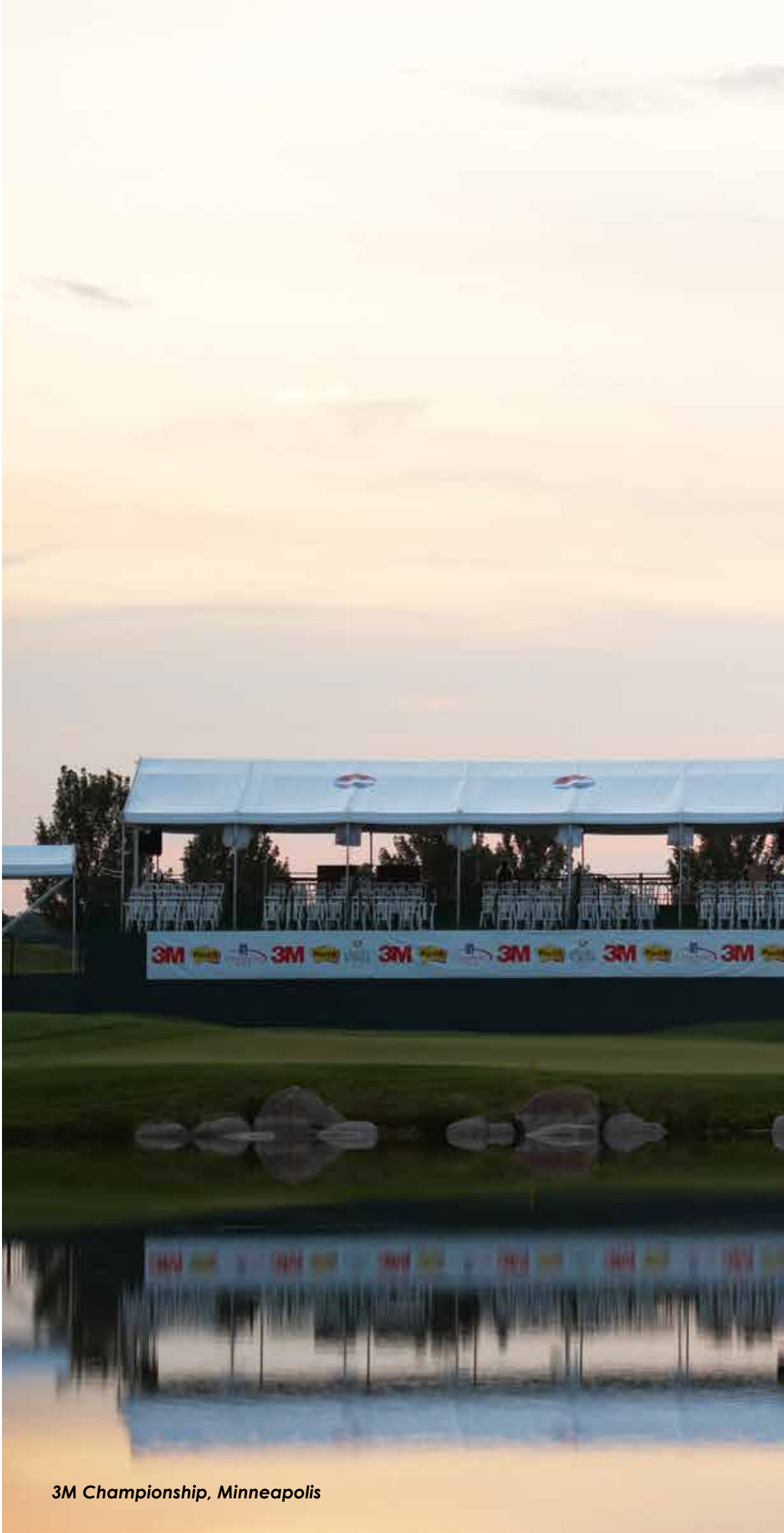
3M Championship, Minneapolis

Our expertise in sporting events is global, counting The Open , the Ryder Cup and numerous European tournaments among our repeat and satisfied customers.